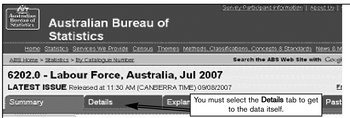
Figure 2: Accessing an ABS publication

When you select a publication it opens on the Summary page. You must click on the Details tab to access the data itself (see Figure 2).